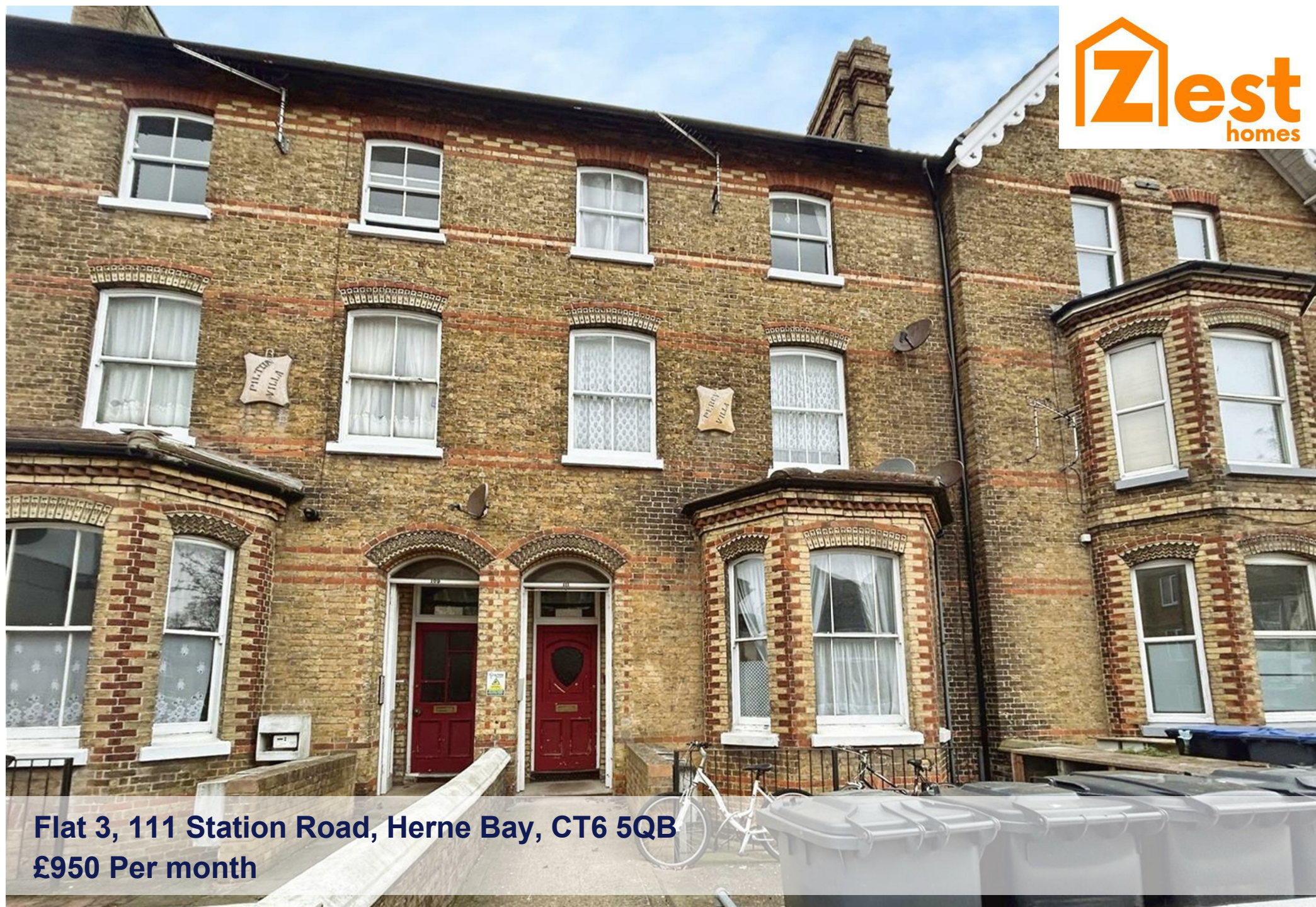
Flat 3, 111 Station Road, Herne Bay, CT6 5QB £950 Per month